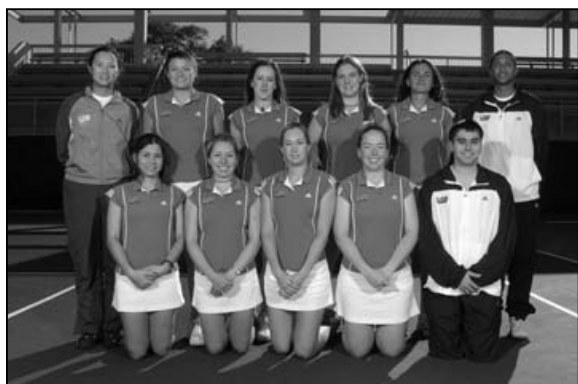
2004 Lady Tigers