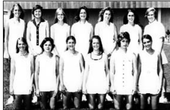
1976 Lady Tigers

LSU capped off its most successful season in school history with a stunning 5-3 upset of No. 11 Tennessee in the opening round of the 1995 NCAA Championships before falling to national runner-up Florida, 5-0, in round two. The Lady Tigers tallied a 19-8 overall record, amassing numerous accolades, including a No. 18 final ranking.