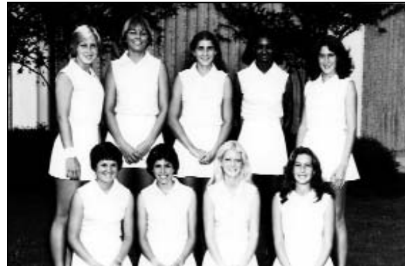
1979 Lady Tigers