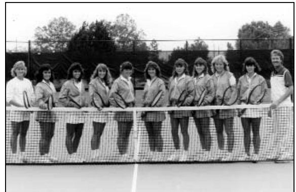
1985 Lady Tigers