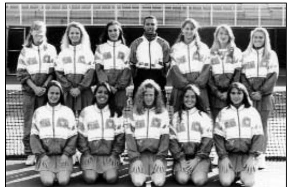
1995 Lady Tigers