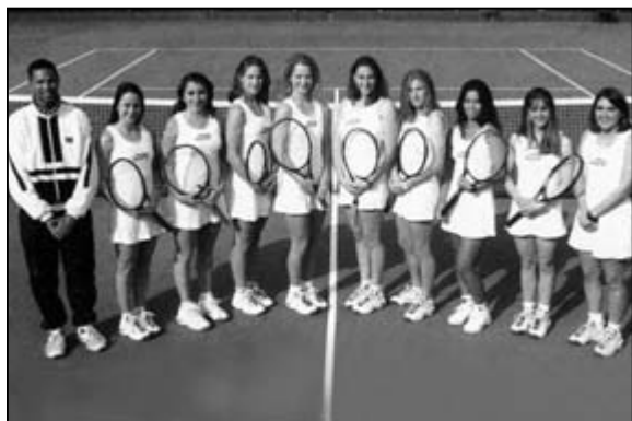
1998 Lady Tigers