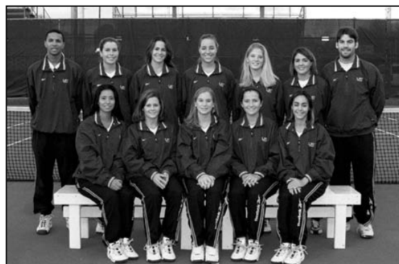
2000 Lady Tigers