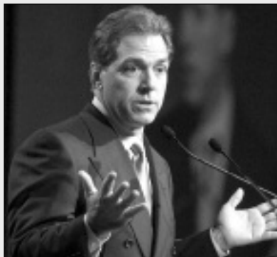
LSU's Nick Saban was named 2003 Associated Press National Coach of the Year as well as being the recipient of the Eddie Robinson Award and the Bear Bryant Award.