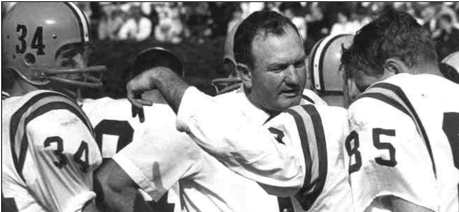
Charlie McClendon was SEC Coach of the Year in 1969 and 1970.