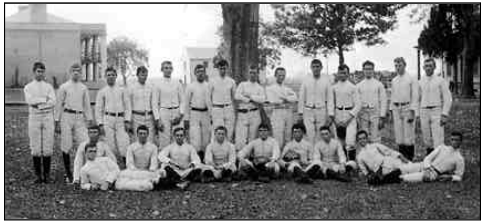
LSU cadets at football practice in the fall of 1894.