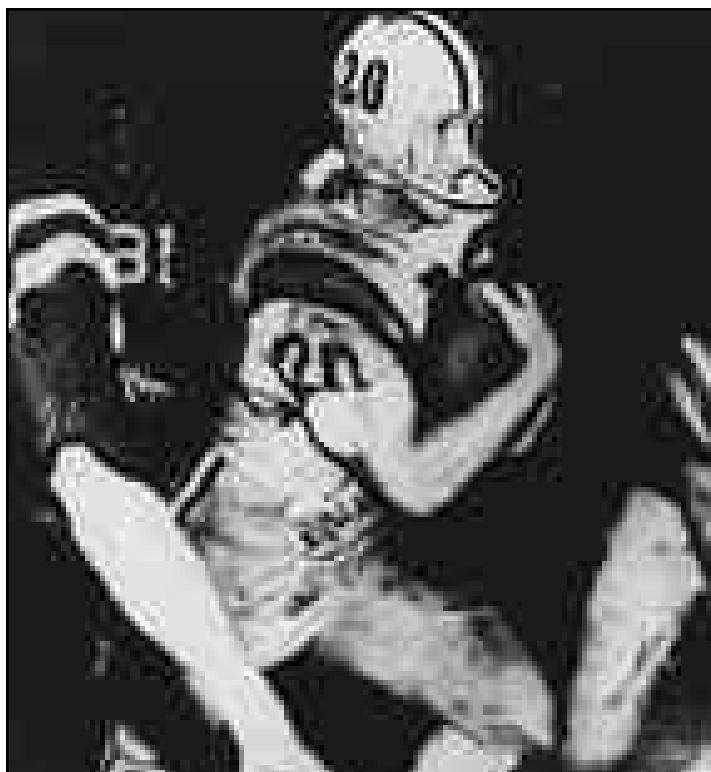
Billy Cannon was the winner of the Heisman and Walter Camp Memorial Trophies in 1959.