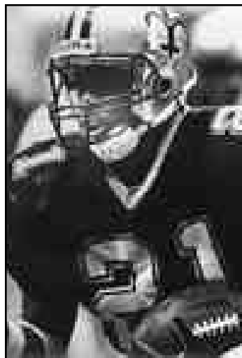
Dalton Hilliard capped his career as the leading rusher in LSU history, then went on to become the second-leading rusher in New Orleans Saints history.