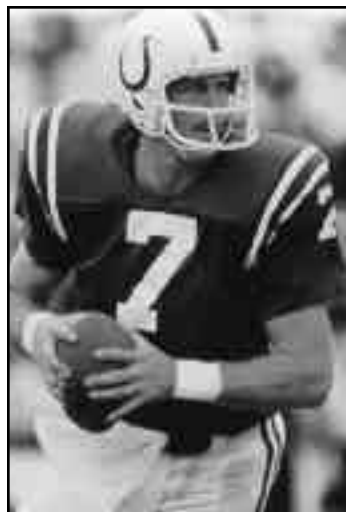
Bert Jones earned All-America honors for LSU in 1972 and he later went on to be an All-Pro quarterback with the Baltimore Colts.