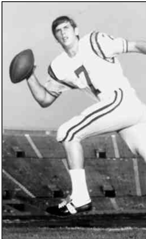
1972 - Bert Jones, QB