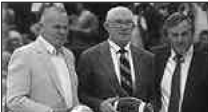
Former LSU greats Steve Van Buren, Y.A. Tittle and Jimmy Taylor are members of the NFL Hall of Fame.