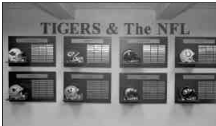
All former and current NFL players are honored in the Players Lounge.